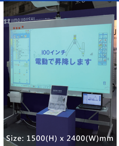
Size: 1500(H) x 2400(W)mm