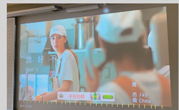
Upgrade to non-reflective board surface for projection 升級至不反光投影表面白板