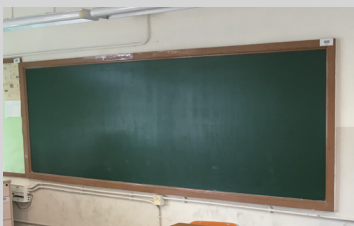
Existing board difficult to remove / expensive to remove 現有寫子板難以移除